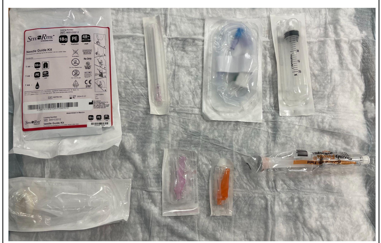
Top row (left to right): probe cover, 18G 3 inch nerve block needle, 3 inch connection tubing, 2x 20 cc syringe