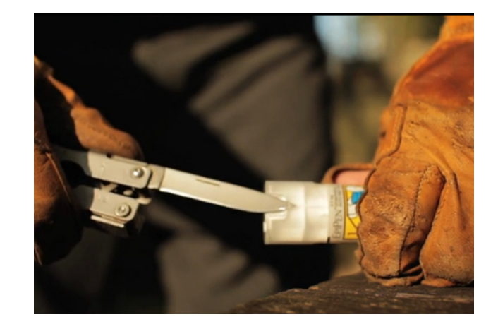
Figure 7. Demonstration of site to initiate cutting using the WMO method on a post-2010 EpiPen.

connection). Separate these 2 cylinders. This must be done carefully to avoid spilling the epinephrine. Figures 9 and 13 demonstrate the carpule removed from the opened auto-injector shell.