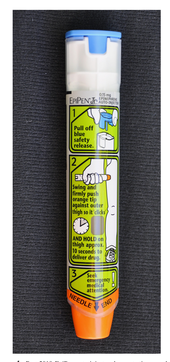
Figure 1. Post-2010 EpiPen auto-injector demonstrating new body, blue safety cap, and orange needle end. Note that this specific autoinjector is an EpiPen Jr. Epinephrine salvage techniques are the same for both EpiPen and EpiPen Jr formulations. Also note that this EpiPen has not been used (the orange shield has not extended, compared with the extended orange shield illustrated in Figure 4). The salvage techniques in this article should never be tried on an unused EpiPen (one whose orange shield is not extended), such as the one illustrated here.

Importantly for wilderness applications, a single dose of epinephrine is frequently not enough to manage even a single episode of anaphylaxis, as many episodes are biphasic or protracted. Because most auto-injectors are single-dose tools, the capability for multiple dosing is extremely unlikely without carrying multiple injectors. Access to multiple injectors is often unfeasible in the wilderness setting because of cost, size, or lack of