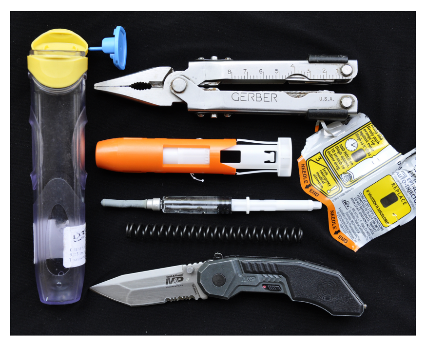
Figure 9. Tools used to remove the carpule, the carpule itself after removal, and the opened auto-injector shell of a post-2010 EpiPen.

• Repeat this firm up-and-down movement several times and the spring and end plug will be released.