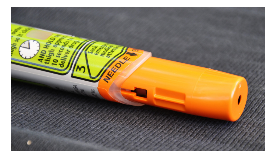
Figure 6. In the post-2010 EpiPen, an orange shell slides out after needle use as illustrated here, protecting the user from the needle during further manipulation (until entire shell is opened and removed, releasing carpule and needle).