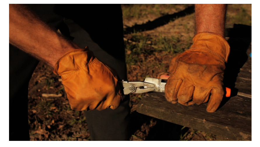
Figure 8. Pry back sheath less than 50%.