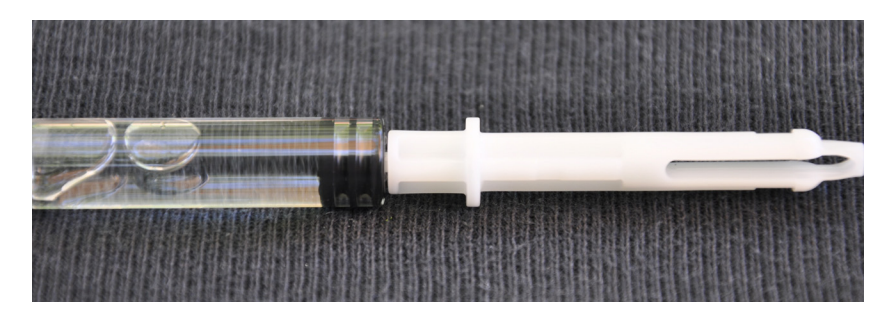
Figure 13. Note air bubbles forming in syringe, and black plunger at edge of glass. That would be the appearance after plunger is drawn back to administer additional doses. An unused EpiPen would also have this appearance (black at end of glass, white entirely outside of glass) but would not have air bubbles in the carpule.