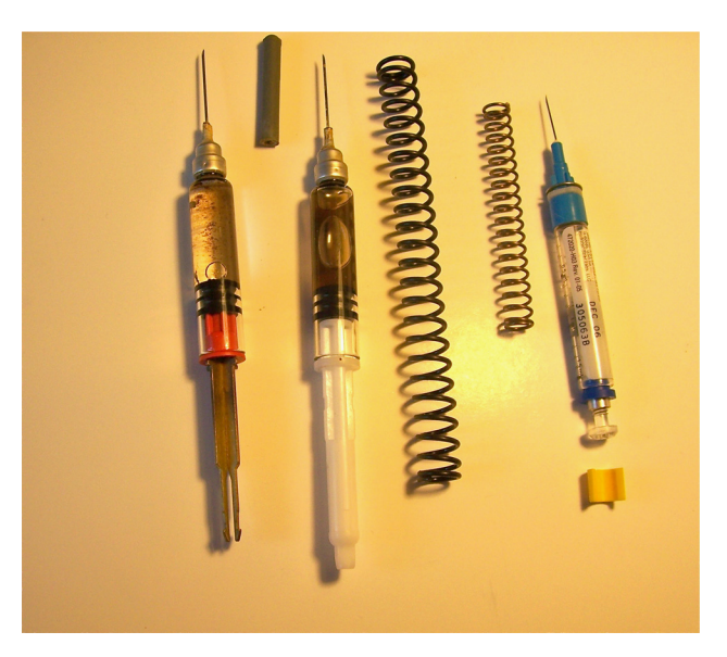
Figure 4. Retrieved material from auto-injectors. From left to right: pre-2010 EpiPen carpule, pre-2010 rubber needle cover, post-2010 EpiPen carpule, auto-injector springs (2 types), Twinject syringe with yellow clip.

compressed spring (Figures 4 and 5). Some practitioners have attempted disassembling nondischarged EpiPens. These attempts usually result in shooting the needle, carpule, and spring a considerable distance with significant force and potential for serious injury. After the autoinjector is fired, the spring almost doubles in length, relieving much of its potential energy. Bear in mind that after discharge, the spring is still under some force in all brands of devices. This residual force will more gently pop out the parts of the auto-injector as it is disassembled.