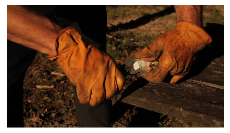
Figure 10. Pliers grip rear of unit.