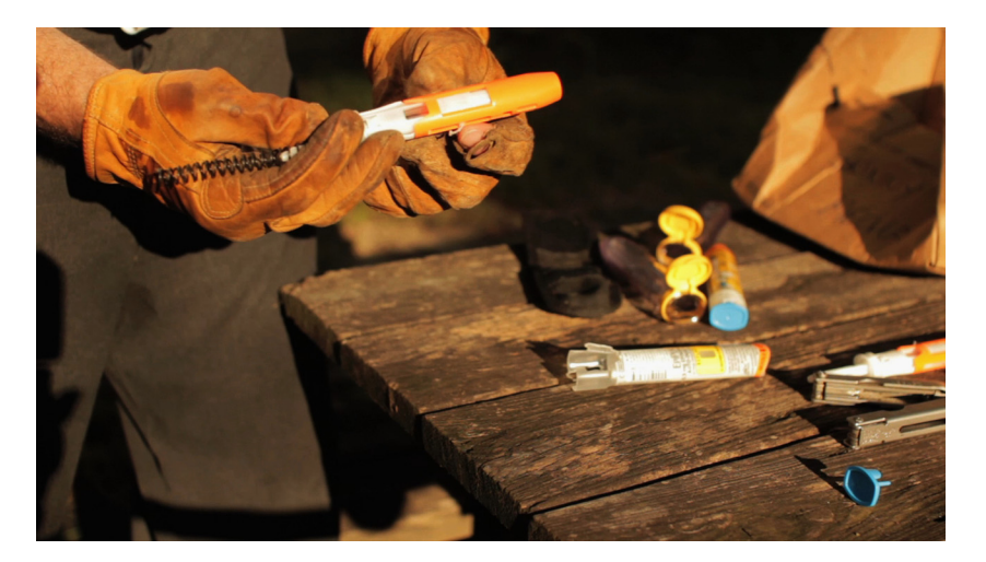
Figure 12. Plastic "wings" on each side of the injector unit must be depressed to release the unit.

• Hold red needle end while injector body is unscrewed 2 and a half turns. Holding the red needle end while turning the body seems to minimize possibility of accidental needlestick.