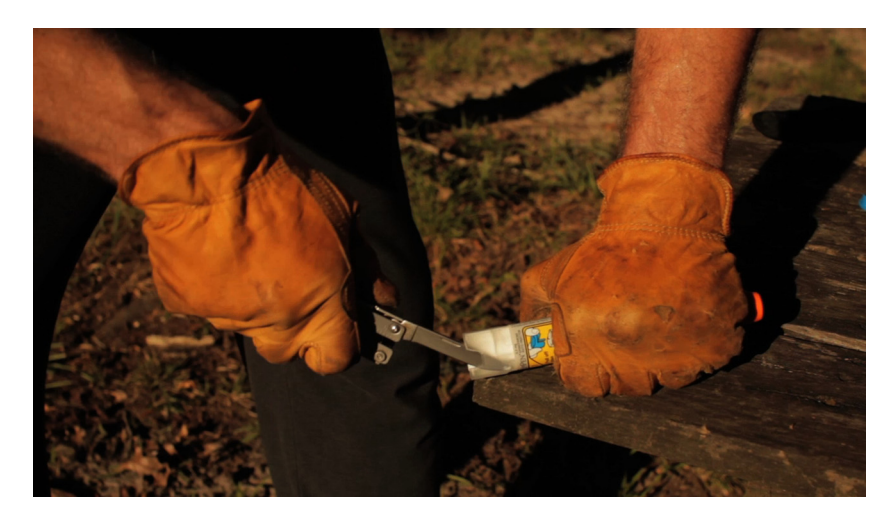
Figure 5. Insert knife edge between rear and sheath of unit.