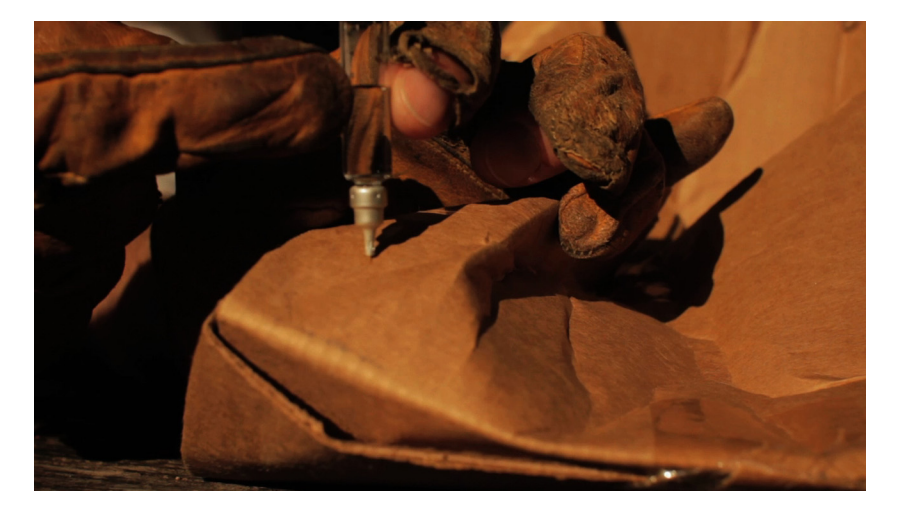
Figure 15. Carpule in place ready for injection shows air bubble above the fluid line. Here, cardboard is simulating the subject's injection site.

In emergency cases of anaphylaxis encountered in the austere, resource-deficient, or wilderness environment, it may be lifesaving to be able to retrieve additional doses of epinephrine from auto-injectors that are otherwise intended only for single dosage. This paper has described a series of techniques, confirmed by practice