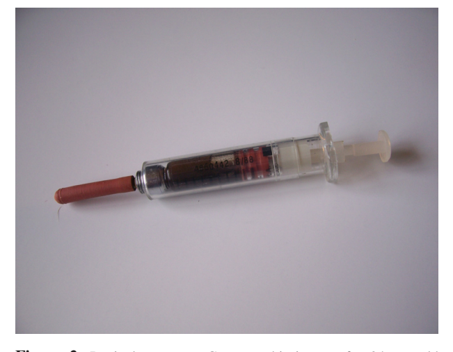
Figure 2. Particulate matter. Compare this image of a 24-year-old Anaguard with particulate matter (do not use auto-injectors with fluid looking like this) to the image in Figure 3 of EpiPen carpules with color change but no particulate matter. Manufacturer recommendations discourage use of discolored fluid, but no evidence can be found of hypothetical or actual adverse effects from using discolored epinephrine.

successfully administered multiple doses of epinephrine from her single-dose Greenstone auto-injector using this technique.