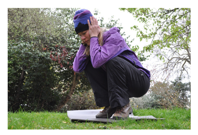
Figure 3. Lightning position.

This panel recommends the separation of group members by greater than 20 feet to limit potential mass casualties, as lightning can jump up to 15 feet between objects. Although each individual should be aware of lightning